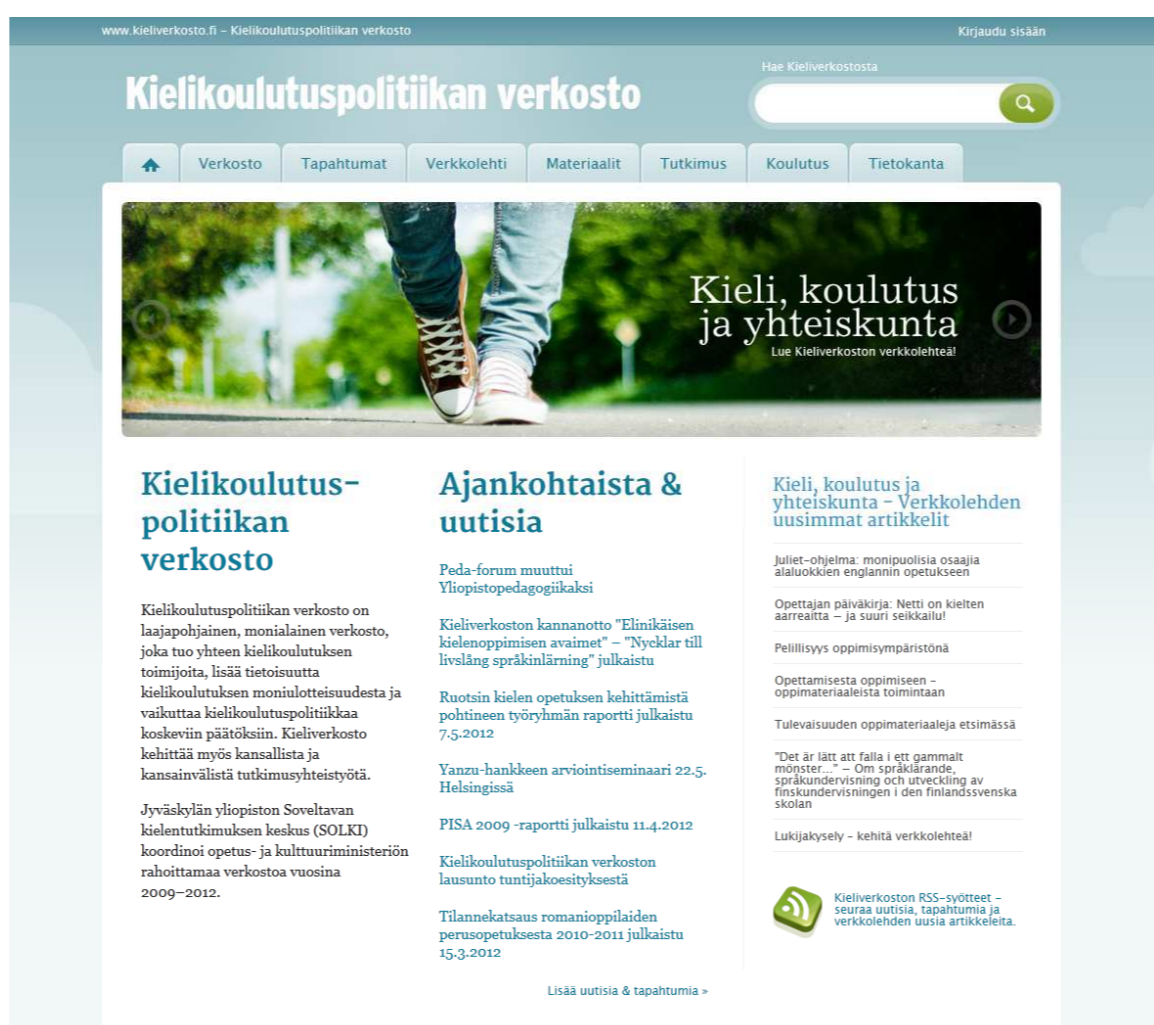
Frontpage of Web Portal Finnish Network for Language Education Policies

The network publishes a freely available web journal called Kieli, koulutus ja yhteiskunta (Language, Education and Society) for short articles on research results and teaching experiments, interviews, policy columns etc.; see www.kieliverkosto.fi/journal .